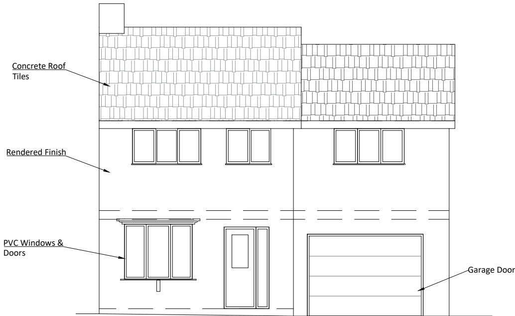
Proposed Front (NE) Elevation