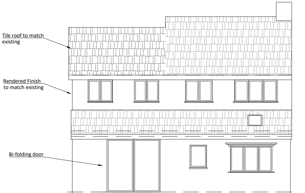
Proposed Rear (SW) Elevation