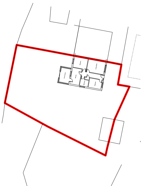
SITE PLAN (existing) SCALE 1:500