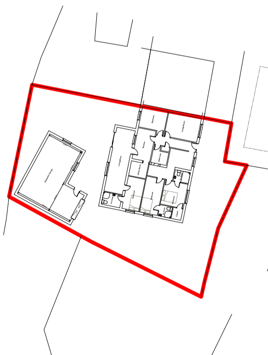
SITE PLAN (proposed) SCALE 1:500