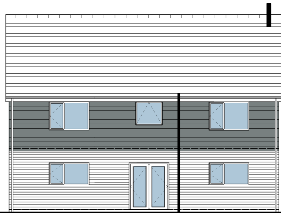
REAR ELEVATION ( NORTH )