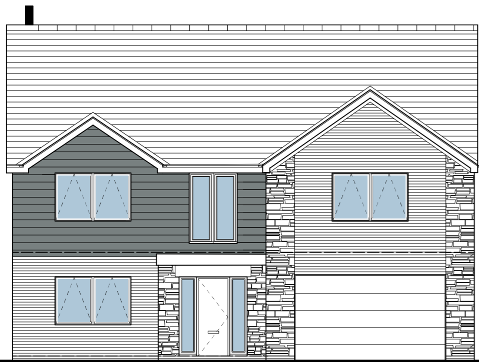
FRONT ELEVATION ( SOUTH )