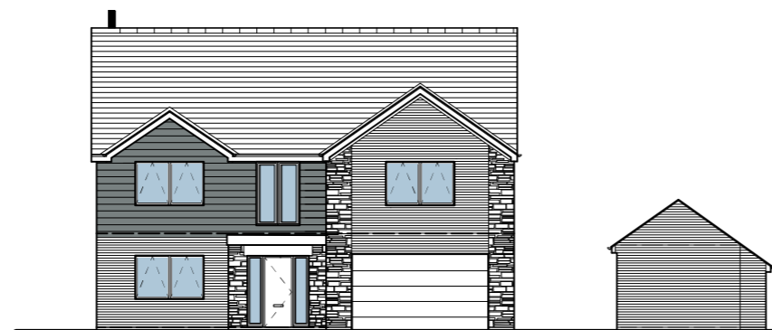
FRONT ELEVATION ( SOUTH ) @ 1:200