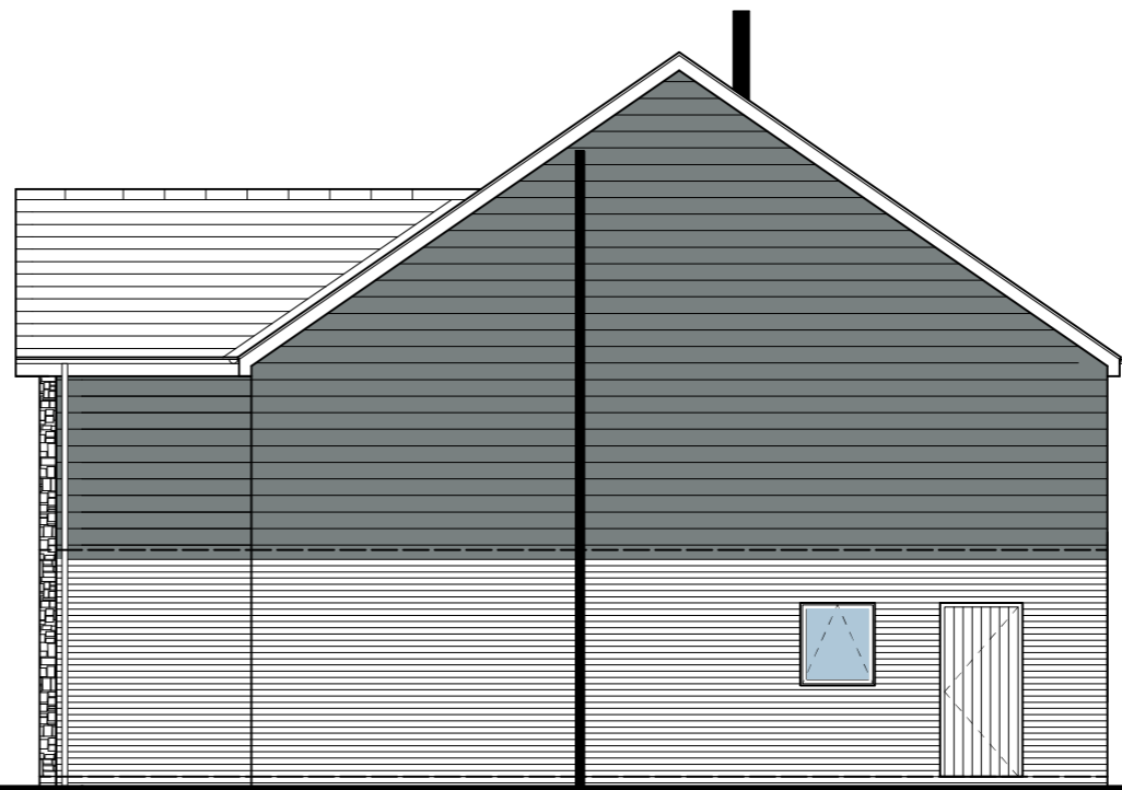
GABLE ELEVATION ( EAST )