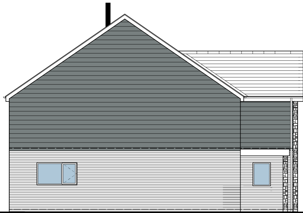
GABLE ELEVATION ( WEST )