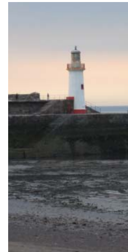
West Pier Lighthouse