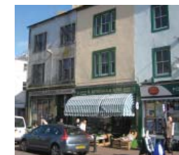
6 Market Place