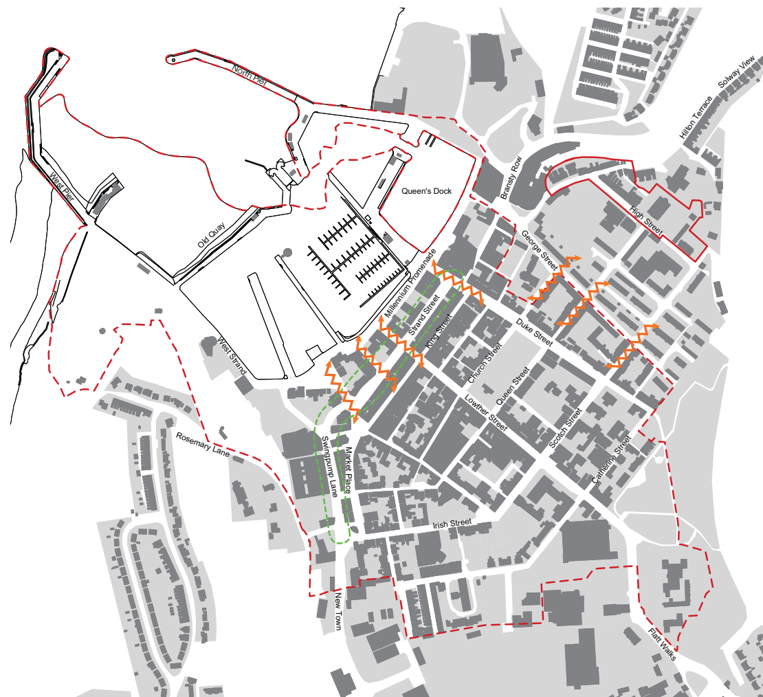
Lack of visual and physical linkages between the town centre and the harbour

Whitehaven's conservation areas consist of two distinct zones – the town centre and the harbour. Visual and physical linkages between these two zones are currently poor and inadequate and this is directly attributable to the town's one-way traffic system and its resultant heavy traffic flows and to the extremely incoherent, incomplete, vacant, derelict and inactive streetscapes which fail to connect the harbour with the town centre.