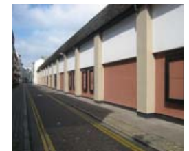
Wilkinsons, Church Street