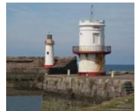
North Pier Lighthouse