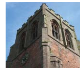
St Nicholas Church tower