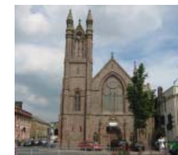
Former Methodist Church