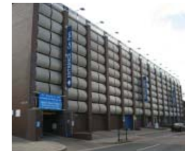
Multi-storey car park