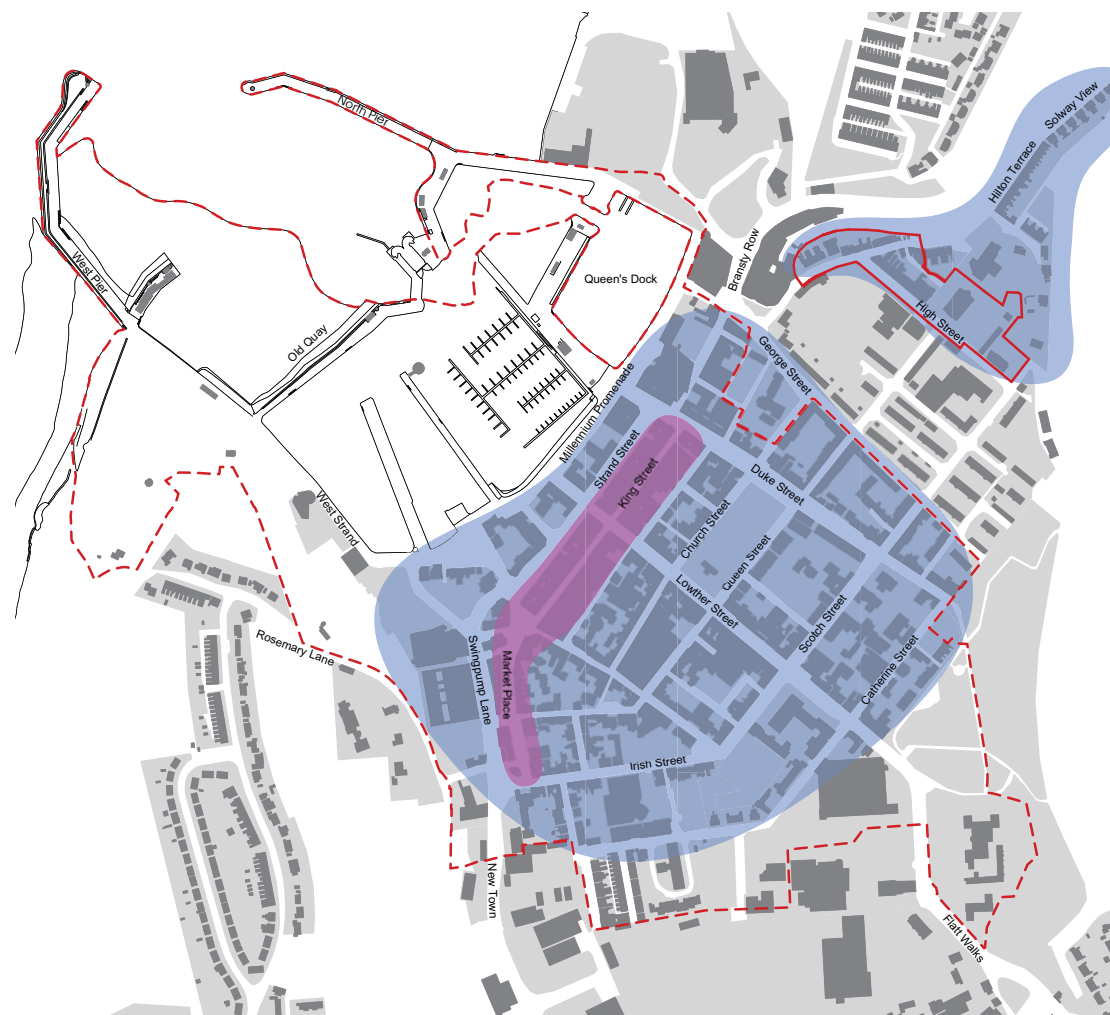
Gradual erosion of special character

One of the biggest threats to the town centre's character is the loss of traditional features and the introduction of inappropriate modern features onto historical and architecturally interesting buildings. Uncharacteristic tiling, modern fenestration, steel security shutters and inappropriate signage and shop frontages are evident, whilst several buildings have been rendered with pebble-dash, painted using inappropriate and unsympathetic colours or have lost some or all of the wrought-iron railings which historically defined their curtilages and entrance steps. Whilst such changes may be small in themselves, if left to persist without intervention, they may have a gradual but cumulative erosive effect on the area's special character.