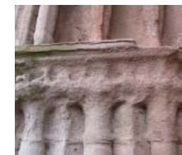
Former Methodist Church