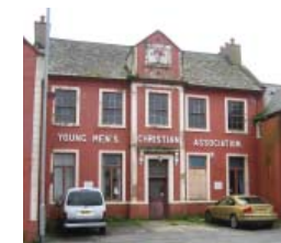
44 - 45 Irish Street