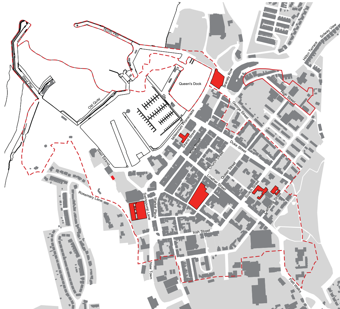
Existing buildings which erode character and quality

The detailed building regulations imposed by Sir John Lowther (1642 – 1706), which stipulated that new buildings had to be at least three storeys high and constructed in continuous rows at the front of building plots immediately adjacent to the street, continue to dominate the town centre. However, there are a number of more modern buildings which fail to adhere to Sir John's design regulations and have removed sections of the area's fine grained street pattern. These buildings have created single continuous blank and inactive façades and uncharacteristic building set-backs. There is a threat that the area's special character may be further undermined by future unsympathetic development.