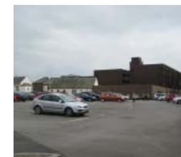
Quay St South Car Park