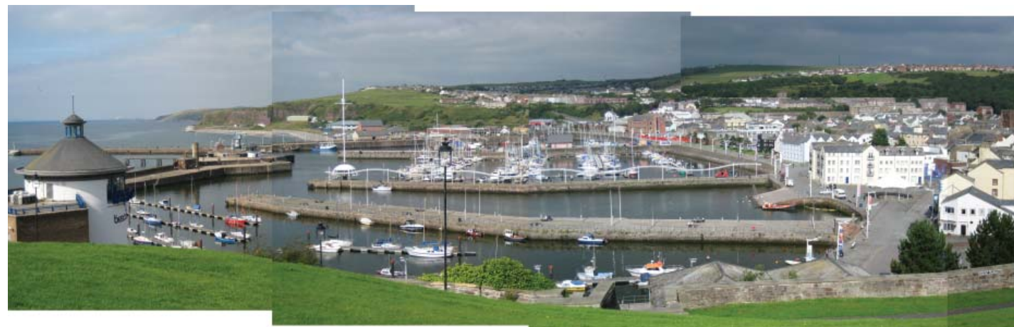
View across harbour and town centre