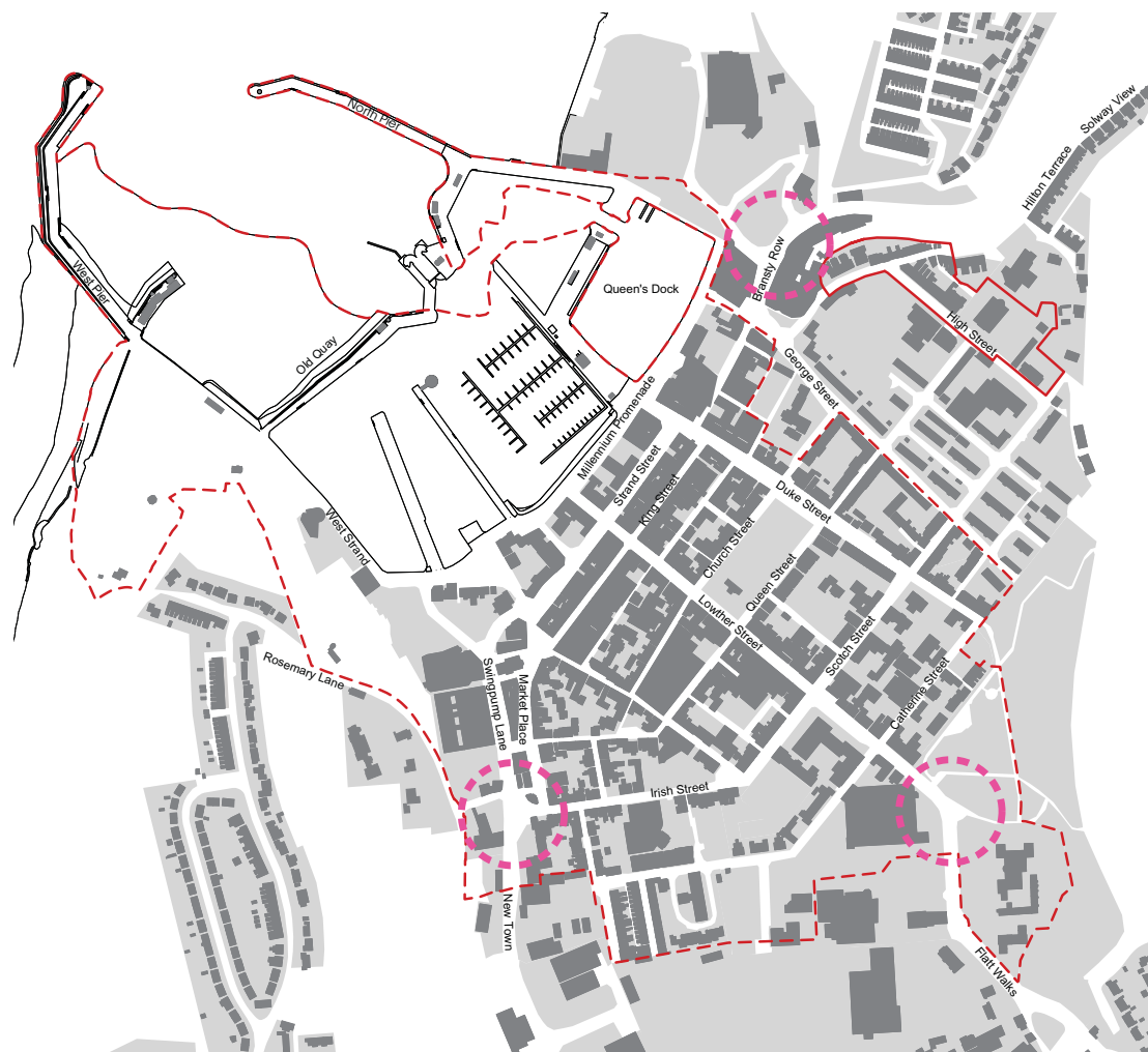
Inadequate gateways into the town centre

Gateways are special places where the combination of street layout and prominent buildings 'announce' the entrance to a town. It is here that the first impressions of a town are typically created. The gateways into Whitehaven's town centre are currently poor and inadequate as they are dominated by vacant, underused and derelict buildings and cluttered with street furniture and vivid and inconsistent signage.