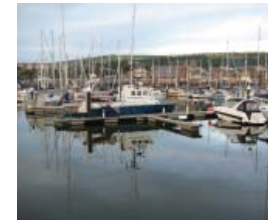
Harbour at dusk