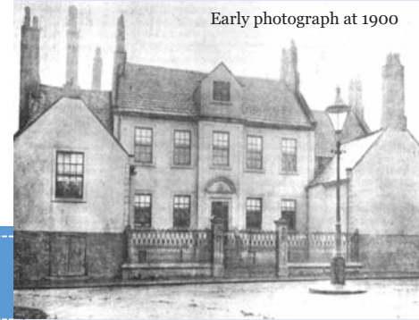
Early photograph at 1900